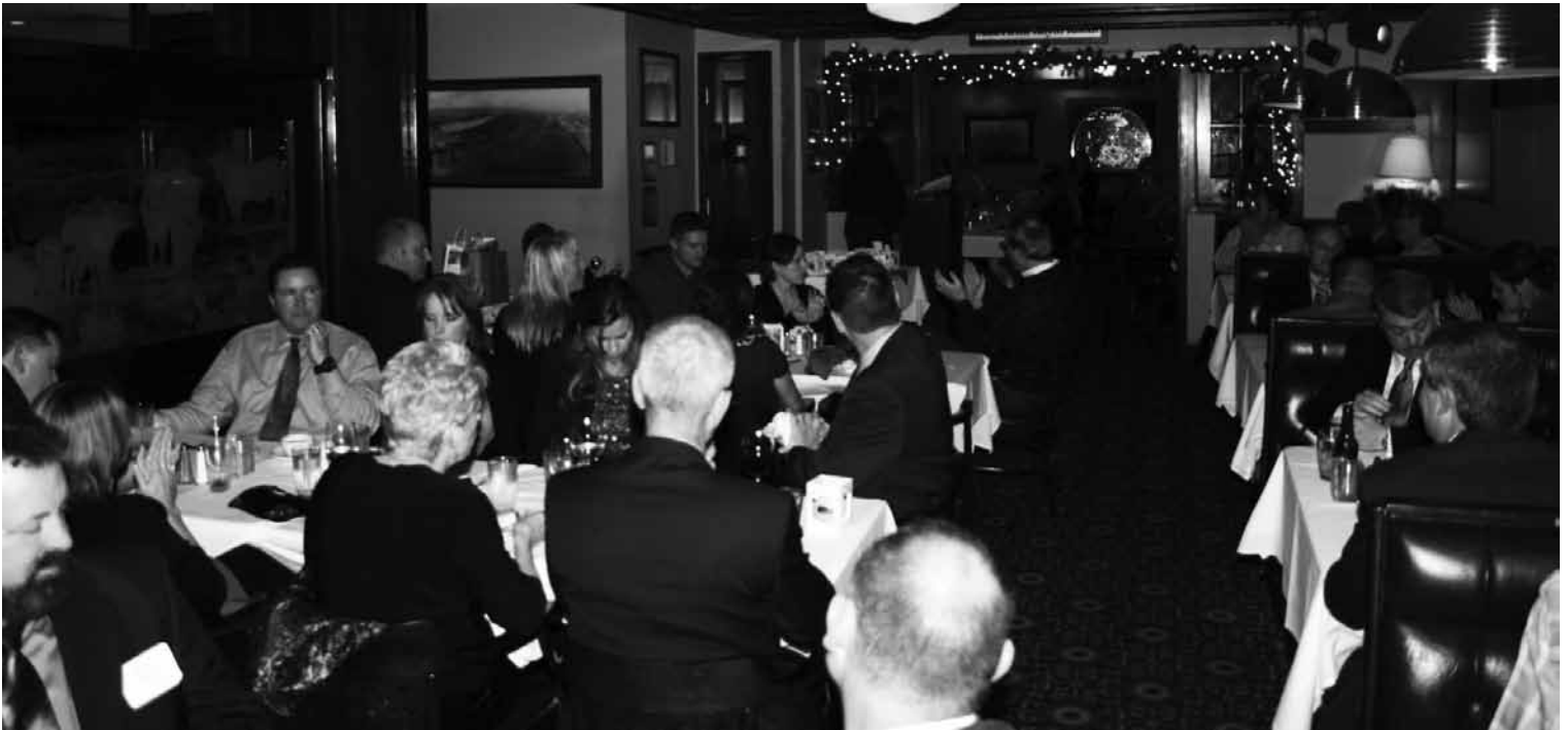
Above: Part of the crowd at the chapter's Christmas Party. Over 70 attended the event at Plaza III.